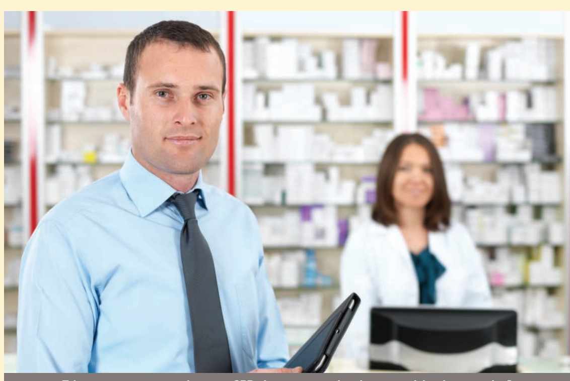
Take a proactive approach to your CPD - have you completed a personal development plan?

The CPD Certification Service (https://cpduk. co.uk/explained) describes continuing professional development as "the learning activities professionals engage in to develop