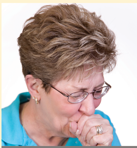
Cough duration is often dictated by its cause