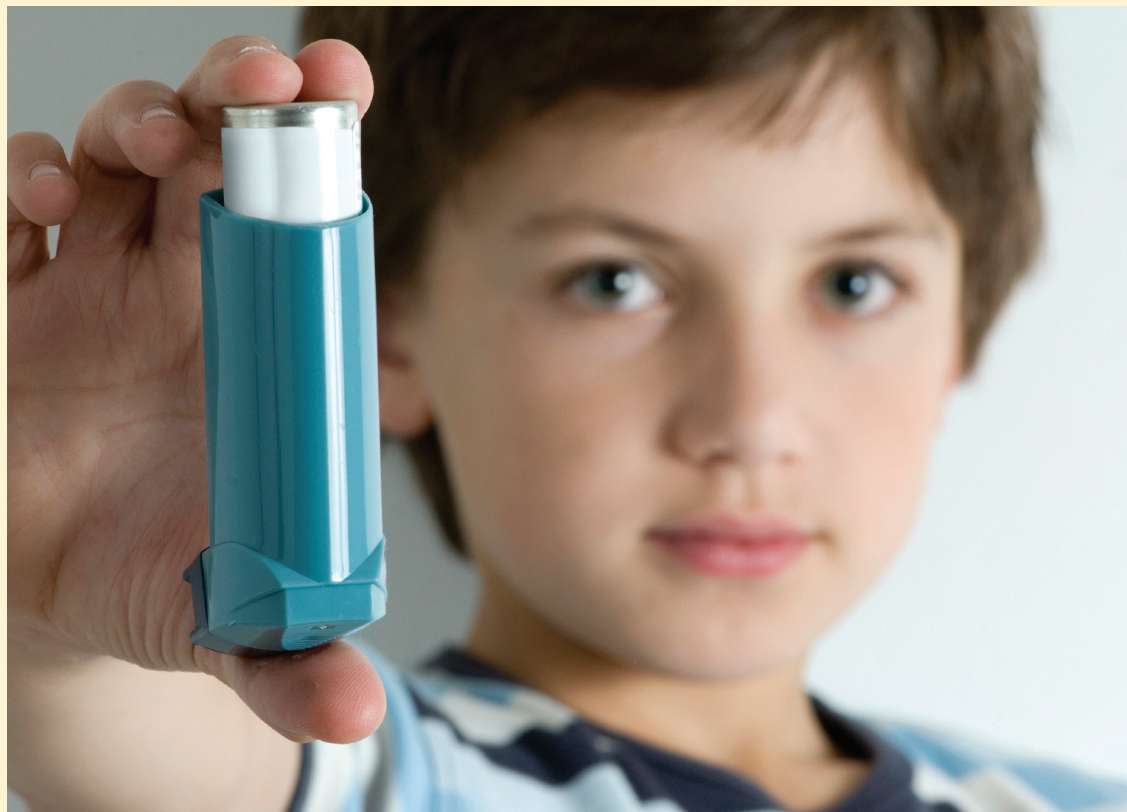
Schools can now hold salbutamol inhalers for use in an emergency

It may also be used with insulin, with or without other antidiabetic drugs. The document can be seen at: www.nice.org.uk/guidance/TA315 .