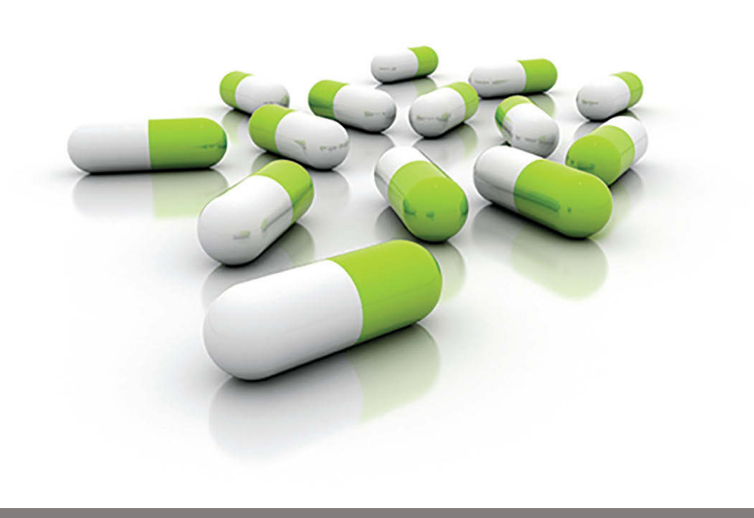
Antibiotic stewardship was a major focus of the last 12 months

Guidance on the same topic for the public is currently being put together by NICE, with publication expected in spring 2016.