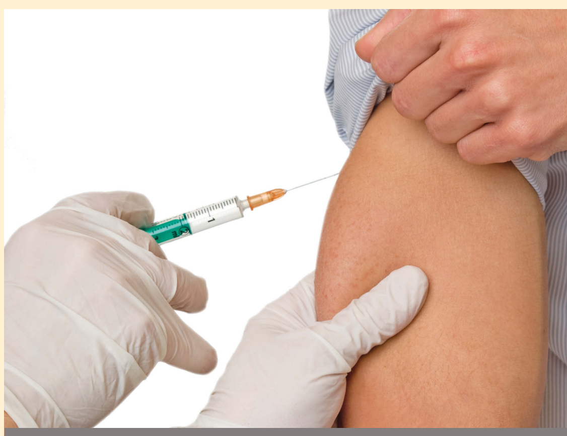
Pharmacists in England have been providing seasonal flu vaccinations

In Scotland, morbidly obese people (i.e. those with a BMI at or above 40kg/m<sup>2</sup>) were included in the eligible at-risk groups for the first time.